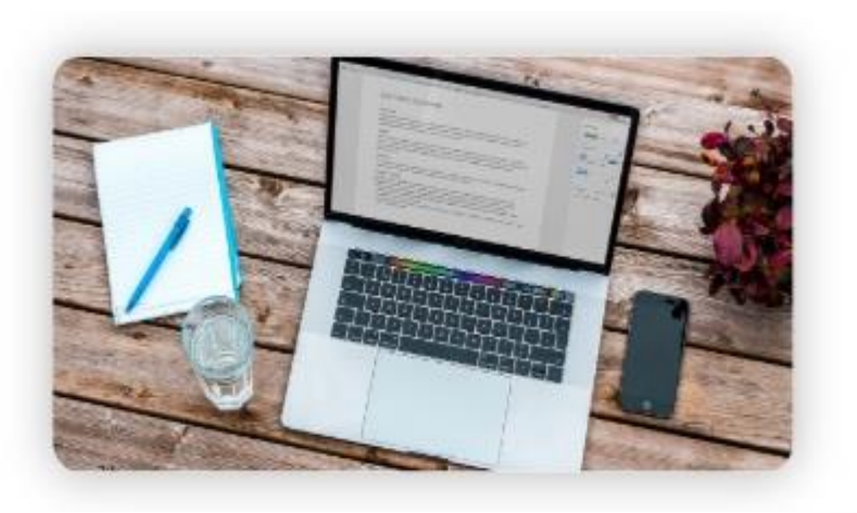
Support the Development of Digital Literacy

The use of the PLD for teaching and learning aims to: